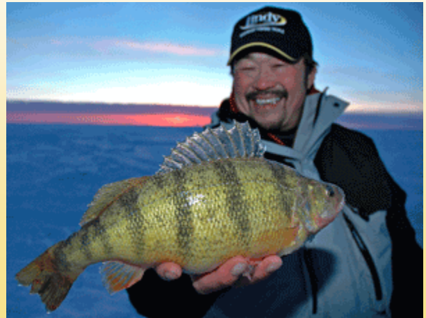
Working with the latest 'small ball' ice jigs from Lindy, Hall of Famer Ted Takasaki is all smiles holding up this brute of a jumbo perch.

Modern ice fishing methods have increased our enjoyment of the sport with advanced electronics, underwater cameras, and space age shelters/clothes which keep you warm. New tackle is also keeping anglers on the cutting edge. Rattles, high intensity glow colors and innovative shapes are catching more fish than ever before.